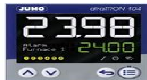
diraTRON 104 / type 702114

The devices can be conveniently configured using a PC with the help of the setup program (incl. program editor and ST editor). No separate voltage supply is required when configuring via the USB interface (USB-powered).