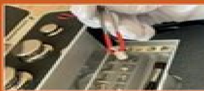
Métoprologie, détection des cavités... et bien plus encore !