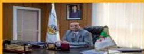
LNHC...vers l'excellence et l'innovation