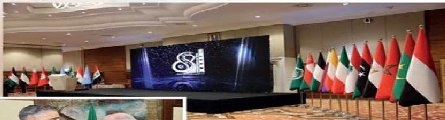
Le LNHC au 8 ème Congrès Arabe de l'Habitat. Une présence à la hauteur de l'événement

Bâtir l'avenir sur des fondations solides