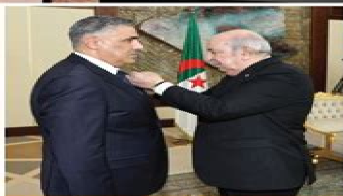
Le Secteur de l'Habitat Mis à l'Honneur