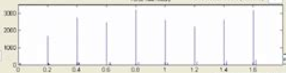
Figure 10: Dependence Learning To an Identity