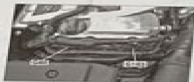
Location of ignition components on 3.2 liter engine. 26 Ignition System