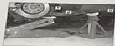
Proper positioning of floor jack and jack stand to lift vehicle safely. 55 Maintenance