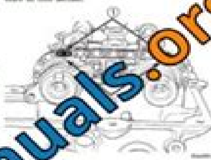
Fig. 56 Crankshaft Chain Timing

(12) Install primary timing chain. Refer to procedure in this section.