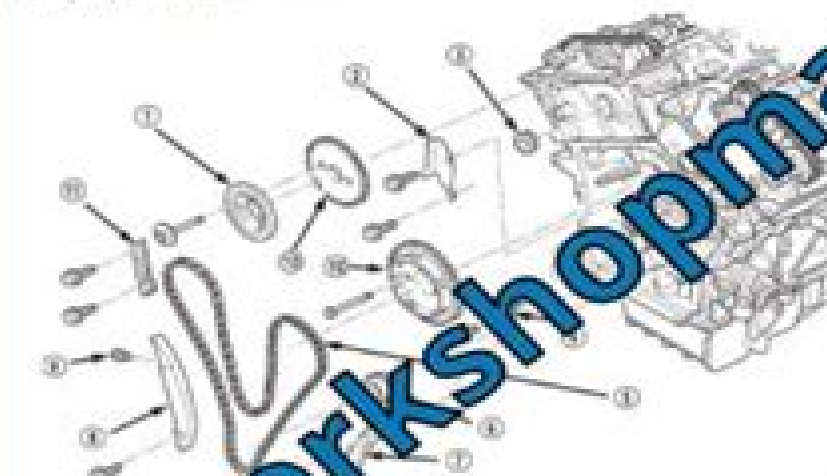
Fig. 54 Primary Timing Drive System

(4) Install rocker arm in original position of removal over valve and lock adjuster. Release tension on valve spring.