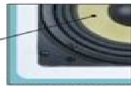
Woven Kevlar Cone with Rubber Surround