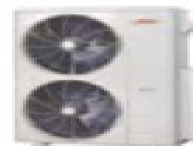
MLB and MPC Multi-Zone