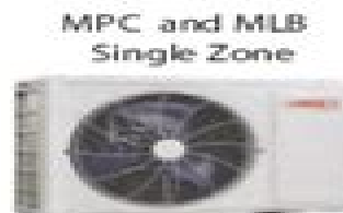
MPC and MLB Single Zone