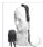
1. Introduction 2. Background 3. Methodology 4. Results 5. Conclusion 6. References