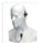
Return to Table of Contents