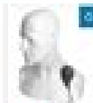
1. QUESTION ANSWER MARKS