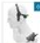
© 2000 Blackwell Science Ltd Journal of Internal Medicine 247: 105–112