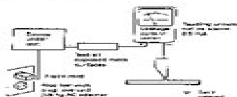
AC Leakage Test

Measure leakage current to a known earth ground (water pipe, conduit, etc.) by connecting a leakage current tester such as Simpson Model 225-2 or equivalent between the earth ground and all exposed metal parts of the appliance (input/output terminals, connectors, metal overlays, control shaft, etc.). Plug the AC line cord of the appliance directly into a 100 V AC 60 Hz outlet and turn the AC power switch on. Any current measured must not exceed 0.5 mA.