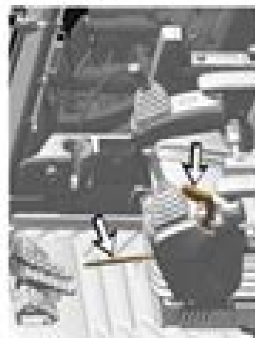
Figure 2 Hydraulic activation control lever - LOCKED position