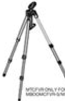
MBOOMCFVR-R FOR MBOOMCFVR-S