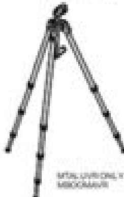
MBOOMCFVR-L FOR MBOOMCFVR-R