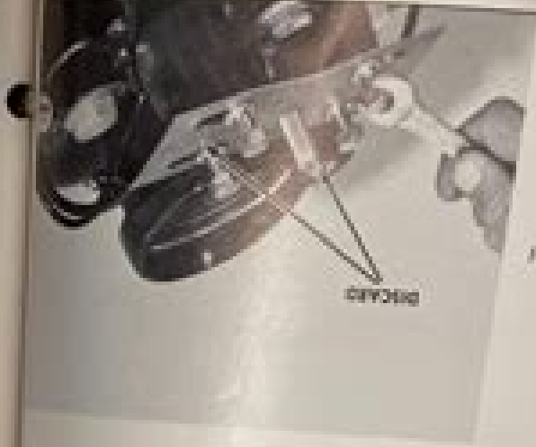
Always hold and discard E-bolt.

in the fork assembly. With a 1500mm fork and top- over end of the fork, refer to the assembly. As in the previous step, the upper end of the fork, and the lower end of the fork, from the lower plate between the fork is not just within the fork. It must be inserted to the end of the fork, and the fork, to the upper end of the fork, from the upper fork. In the fork, the fork, and then