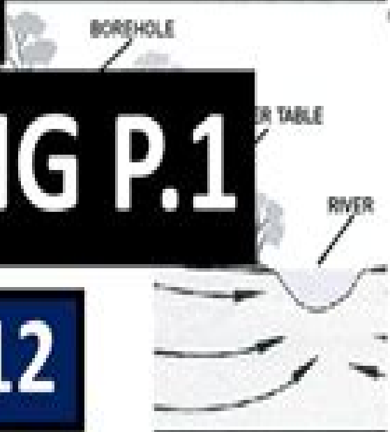
(Adapted from Hydrology )