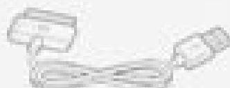
Dock Connector to USB Cable

10W USB power adapter: Use the 10W USB power adapter to provide power to iPad and charge the