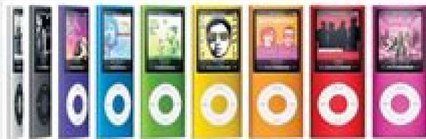
4G iPod nano