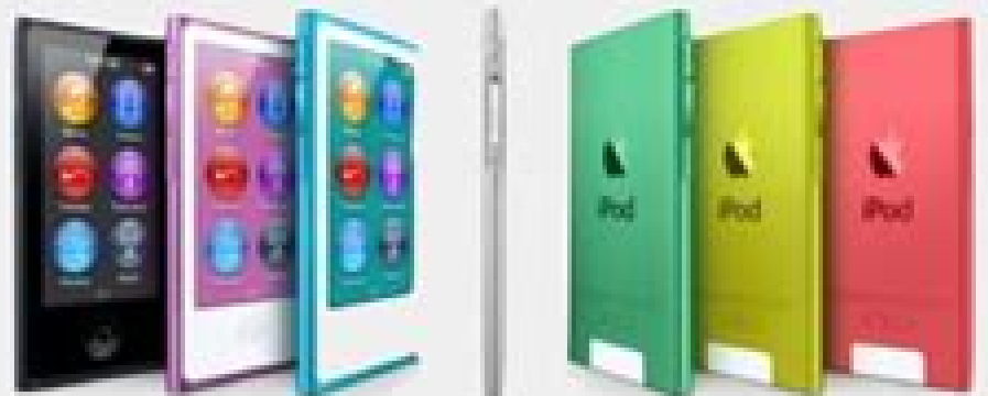
New iPod nano