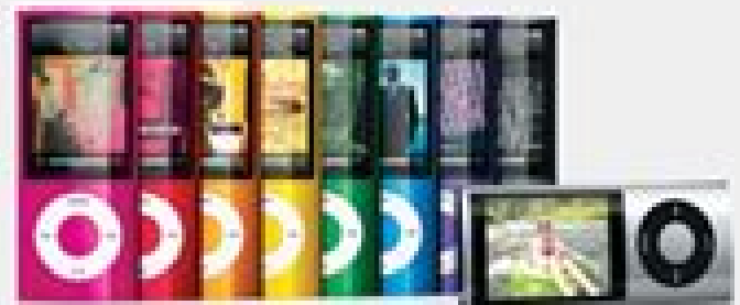
5G iPod nano