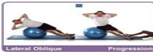
Lateral Oblique Progression Brace feet against partner or wall for assistance.