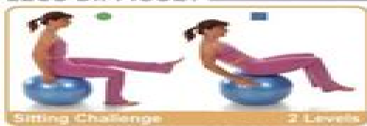
Sitting Challenge 2 Levels 2 Variations of difficulty.