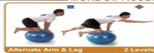
Alternate Arm & Leg 2 Levels Slowly extend arm and leg.