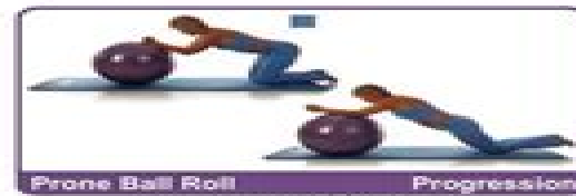
Prone Ball Roll Progression Roll until straight hip alignment.