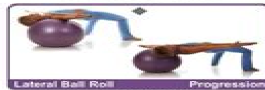
Lateral Ball Roll Progression Thumbs up; tongue on roof of mouth.