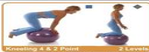
Kneeling 4 & 2 Point 2 Levels Use caution in 2 point position.