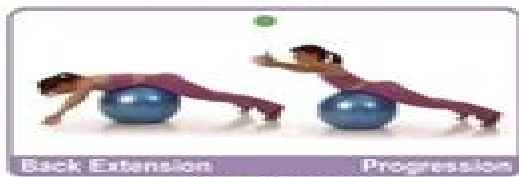
Back Extension Progression Thumbs up; extend back.