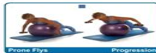
Prone Flys Progression Pull shoulder blades back and down.