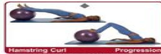
Hamstring Curl Progression Pull heels in until 90° at knees.

WARNINGS - Do not use this equipment without a complete understanding of its intended purpose and function. By stepping on this equipment the user accepts full responsibility for all rules and injury and waives any right to themselves, their heirs, executors or any part to hold the manufacturer or its representatives responsible for any direct or indirect damages whatsoever caused by use of the equipment. Only use Fitter products in a safe clear area on a flat dry surface. Children must not play on this equipment unsupervised. Consult a physician before starting this or any exercise program.