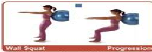
Wall Squat Progression Keep knees behind toes.