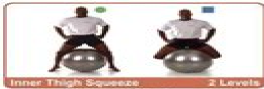
Inner Thigh Squeeze 2 Levels Squeeze knees in. Standing or sitting.