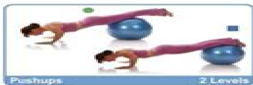
Pushups 2 Levels 2 variations of difficulty.