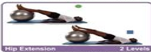
Hip Extension 2 Levels Extend hips until straight alignment.