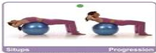
Situps Progression Lift chest toward ceiling.