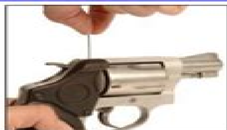
The hole at the top adjusts elevation (vertical alignment).*