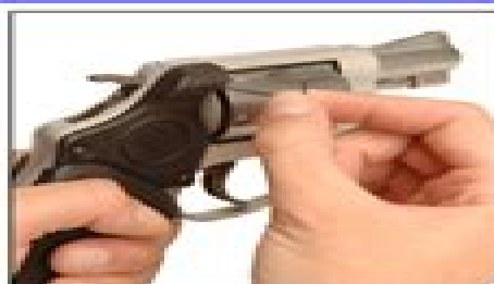
The hole at the side adjusts windage (horizontal alignment).**

NOTE: When installing J-Max™ for the first time, a slight shift in alignment may be noticed after firing, due to settling. Recheck alignment after your first trip to the range. Readjust if necessary.