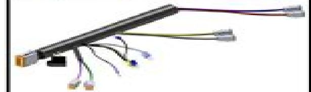
Leveling Pump Harness