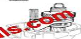
Fig. 6 Removing layshaft extension assembly