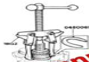
Fig. 4 Removing 5th gear