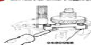
Fig. 5 Removing 5th selector roll pin