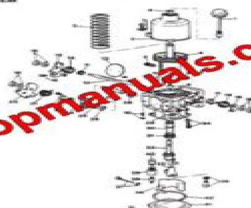
Fig. 1 COMPONENTS OF THE S.L.H.P. CARBURETTOR