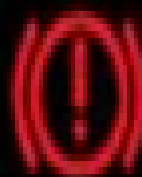
Brake system warning light