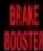
Brake booster warning light