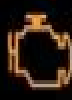
Check engine warning light