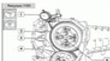
Fig. 1005 Removal of the timing belt. The timing belt is removed from the crankshaft pulley. The belt is shown in a curved position, and the pulley is labeled with a number 1.

Fig. 1004 Removal of the timing belt. The timing belt is removed from the crankshaft pulley. The belt is shown in a curved position, and the pulley is labeled with a number 1.