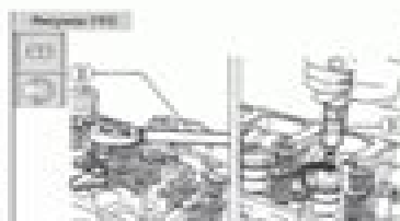
Fig. 1007 Removal of the timing belt. The timing belt is removed from the crankshaft pulley. The belt is shown in a curved position, and the pulley is labeled with a number 1.

Fig. 1006 Removal of the timing belt. The timing belt is removed from the crankshaft pulley. The belt is shown in a curved position, and the pulley is labeled with a number 1.