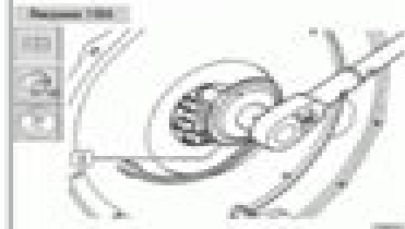
Fig. 1001 Removal of the timing belt. The timing belt is removed from the crankshaft pulley. The belt is shown in a curved position, and the pulley is labeled with a number 1.

Fig. 1000 Removal of the timing belt. The timing belt is removed from the crankshaft pulley. The belt is shown in a curved position, and the pulley is labeled with a number 1.