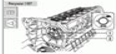
Fig. 1002 Removal of the timing belt. The timing belt is removed from the crankshaft pulley. The belt is shown in a curved position, and the pulley is labeled with a number 1.

Fig. 1001 Removal of the timing belt. The timing belt is removed from the crankshaft pulley. The belt is shown in a curved position, and the pulley is labeled with a number 1.