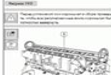
Fig. 1008 Removal of the timing belt. The timing belt is removed from the crankshaft pulley. The belt is shown in a curved position, and the pulley is labeled with a number 1.

Fig. 1007 Removal of the timing belt. The timing belt is removed from the crankshaft pulley. The belt is shown in a curved position, and the pulley is labeled with a number 1.