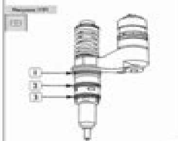
Fig. 1006 Removal of the timing belt. The timing belt is removed from the crankshaft pulley. The belt is shown in a curved position, and the pulley is labeled with a number 1.

Fig. 1005 Removal of the timing belt. The timing belt is removed from the crankshaft pulley. The belt is shown in a curved position, and the pulley is labeled with a number 1.