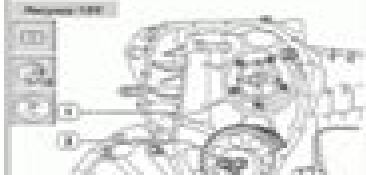
Fig. 1004 Removal of the timing belt. The timing belt is removed from the crankshaft pulley. The belt is shown in a curved position, and the pulley is labeled with a number 1.

Fig. 1003 Removal of the timing belt. The timing belt is removed from the crankshaft pulley. The belt is shown in a curved position, and the pulley is labeled with a number 1.