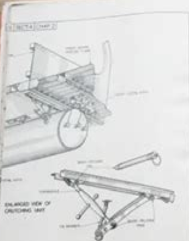
2 FOR 4000 LB BOMB