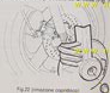
Fig. 22 (ispezione pastiglie)