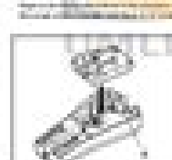
Fig. 4. P-touch PT-1090 1. Label tape 2. Label tape cover 3. Label tape 4. Label tape cover