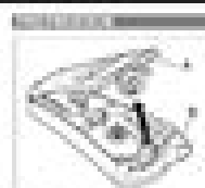
Fig. 1. P-touch PT-1090 1. Power button 2. Template button 3. Alphanumeric keys 4. Print button 5. Battery cover latch 6. Battery cover 7. Battery compartment 8. Battery 9. Label tape 10. Label tape cover