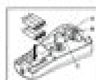
Fig. 2. P-touch PT-1090 1. Label tape 2. Label tape cover 3. Label tape 4. Label tape cover