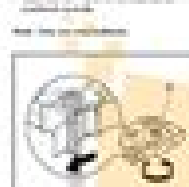
Fig. 3. P-touch PT-1090 1. Label tape 2. Label tape cover 3. Label tape 4. Label tape cover