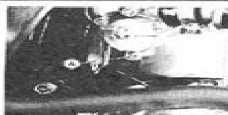
Carburetor float bowl drain plug (A)

CAUTION: Be sure to do this in a well-ventilated area a safe distance from sparks or open flames.