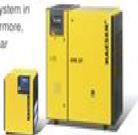
Series: SX - ASK

The SIGMA CONTROL basic is available with KAESER's SX, SM, SK and ASK series rotary screw compressors. It is the perfect solution for users who initially require a single compressor for their air supply, but who also may wish to expand the compressed air system in the future. Furthermore, KAESER's modular control and compressed air management concept ensures trouble-free system compatibility.