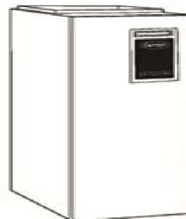
Fig. 1 - Multiprise Furnace in Upflow Orientation