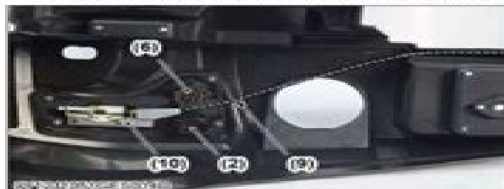
(2) PTO Switch (6) Ignition switch (9) Throttle cable (10) Bracket