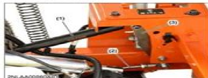
(1) Damper (2) Control rod (3) Damper bracket