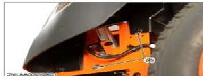
(1) L.H. fender (2) Rolling thread bolt