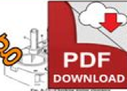
Fig. 8-11—Checking piston ring gap