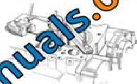
Fig. 8-10—Checking cylinder bore diameter

A small hole is drilled through the block into the middle grommet to the crankside of coolant leakage point.